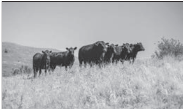
SVR REVOLUTION 3173