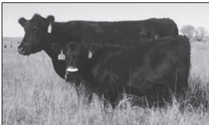
SVR FIRST CALF HEIFER PAIR

COW BULL prospect, 5127 is a full brother to SVR senior herd sire "SVR Range Master 1175." Both of them were part of a 2010 flush. His mother, the 604 cow, is one of our most productive donors. His full siblings have been extraordinarily well received in the commercial market and his sisters have stayed in our herd. Flush brother to 5155.