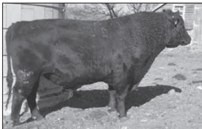
SVR RANGE MASTER 2054

HEIFER BULL prospect who is another son of 9141. 5143 is pure Wye genetics combining Prince of Malpas, Fabron of Wye, and Bonanza of Wye in the first line of a pedigree. 5143 is a 3/4 sibling to Quintes of Wye UMF 10502, who is one of our herdsires. 5143's sisters are standout front pasture heifers. His bull calves will be stout and his females will be long-lived, highly productive, broody cows.