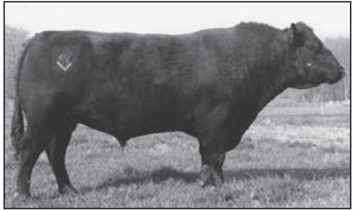
BEAR OF WYE UMF 6591

HEIFER BULL prospect that should ensure easy calving and efficient cattle. We are really happy with the consistency and production of both bull and heifer calves produced by crossing Yancey and Beeler.