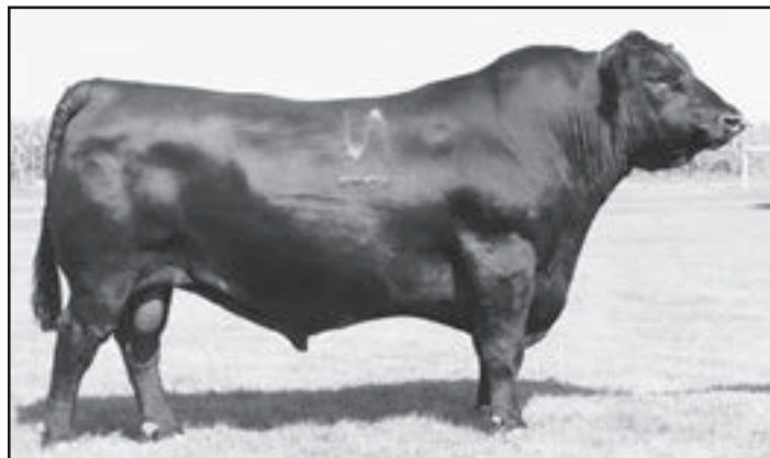
N BAR EMULATION EXT