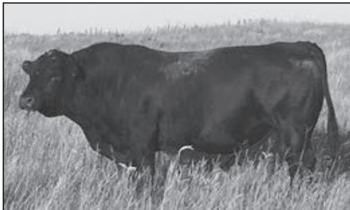
SVR RANGE MASTER 1201

HEIFER BULL prospect, has a proven pedigree backed by longevity and fertility. His maternal grandam, SVR donor 542, is still in production at 12. 5168's dam has a full brother who is one of our herd sires. 5168's sire is the product of the proven Lodge of Wye mating with our 04F3 cow. This pedigree gets results.