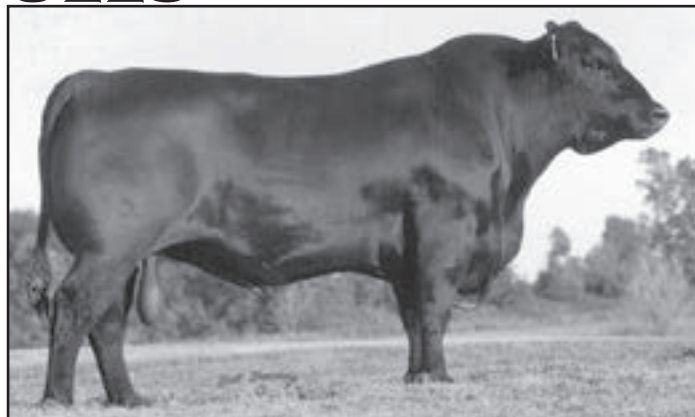
PARAMOUNT AMBUSH 2172

HEIFER BULL prospect and natural calf sired by 6V47 out of donor dam 542. 542 has had several really nice bulls in past sales, which have made several cattlemen very happy. At age 12, 542 now has daughters producing sale bulls, which demonstrates the strength of her lineage. One of 542's sons is an SVR herd sire, SVR Range Master 2066.