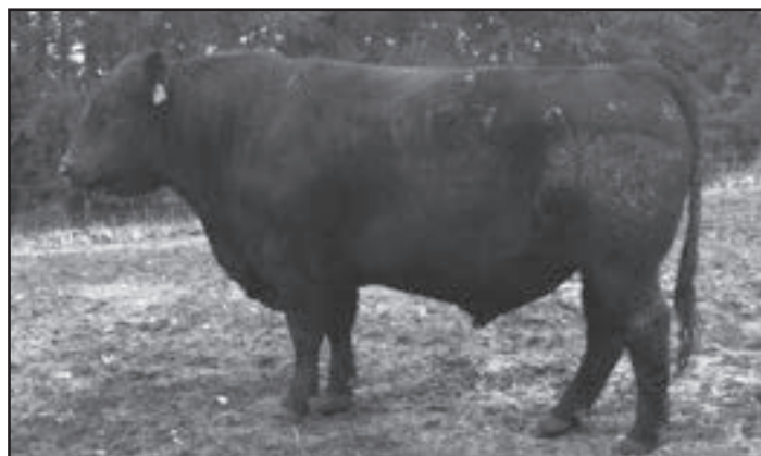
SVR RANGE MASTER 0127

COW BULL sired by Cole Creek 782 and out of a good uddered, easy keeping Emblazon 854E daughter. 5181 is backed by strong Shoshone genetics on the maternal side.