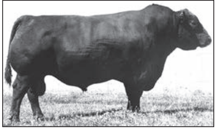
R R RITO 707

HEIFER BULL We brought 6V47 into the program to keep the maternal goodness of Emulation while adding depth, growth, carcass, length and spring of rib. We wanted to breed Express, a son of A1747 and a grandson of EXT, with the excellent females sired by our herd sire Sinclair Bush Ranger 9X16 - a full brother to N Bar Shadow. 5125 proves the breeding of Express with Bush Ranger daughters works. 5125 is strengthened by his grandam, our foundation donor 784. The calving predictability is here, as Express King's mother has had her three calves within a ten-day window.