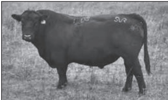
SVR RANGE MASTER 0108

HEIFER BULL prospect. 5149 offers pure Wye genetics. His mother 9141 is a front pasture donor who is one of our best cows. His full brothers sold at Wye last spring as yearlings. Two of her sons are in the Cotton Angus herd, including one by Lodge of Wye, a 7/8's brother to 5149's sire, Federal. Another son of 9141, by Fabron of Wye, tied for higher seller in our 2015 sale and is working hard in Burkes Garden, Virginia. Don't miss this bull.