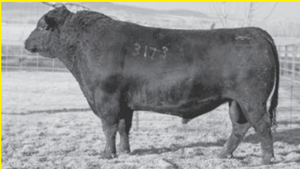
SVR REVOLUTION 3173

FRIDAY, FEBRUARY 3, 2017 • 1:00 P.M. (CST) Burwell Livestock Market, Burwell, Nebraska